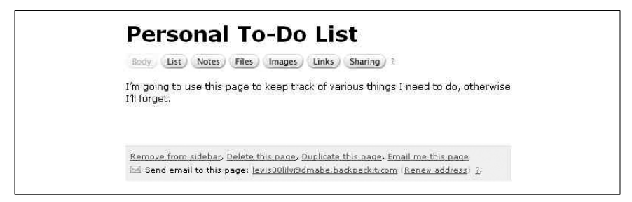
Figure 4-46. A page and its email address

Each page in Backpack has an email address. Look at the bottom of your newly created page, as shown in Figure 4-46. This particular page has an email address of lewis00lily@dmabe.backpackit.com.