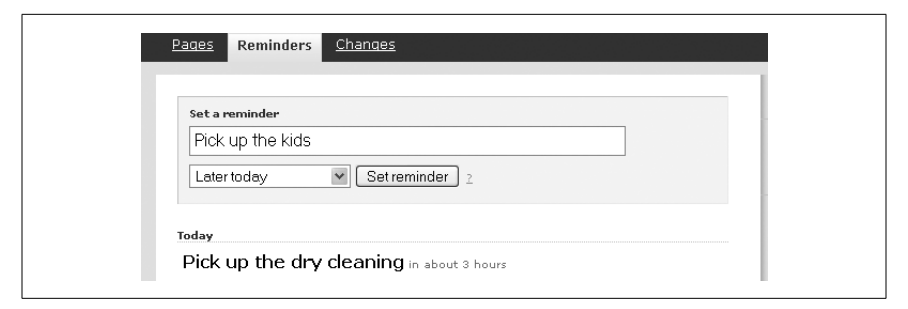
Figure 4-49. Adding a reminder in your desktop browser