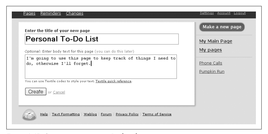
Figure 4-45. Creating a new page in Backpack

Click the Make a New Page button on the right to add another page to Backpack, as shown in Figure 4-45. Add a title and some content and click Create. You'll be taken to your new page, where you can use Backpack's very spiffy web interface to add lists, notes, files, images, and links to your page.